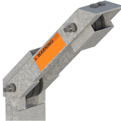
Double Groove Sheaves with Stainless Steel Bearings